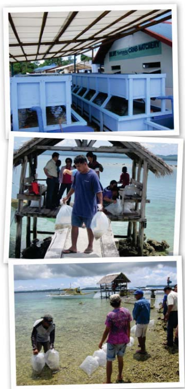
releasing juvenile crabs into the water